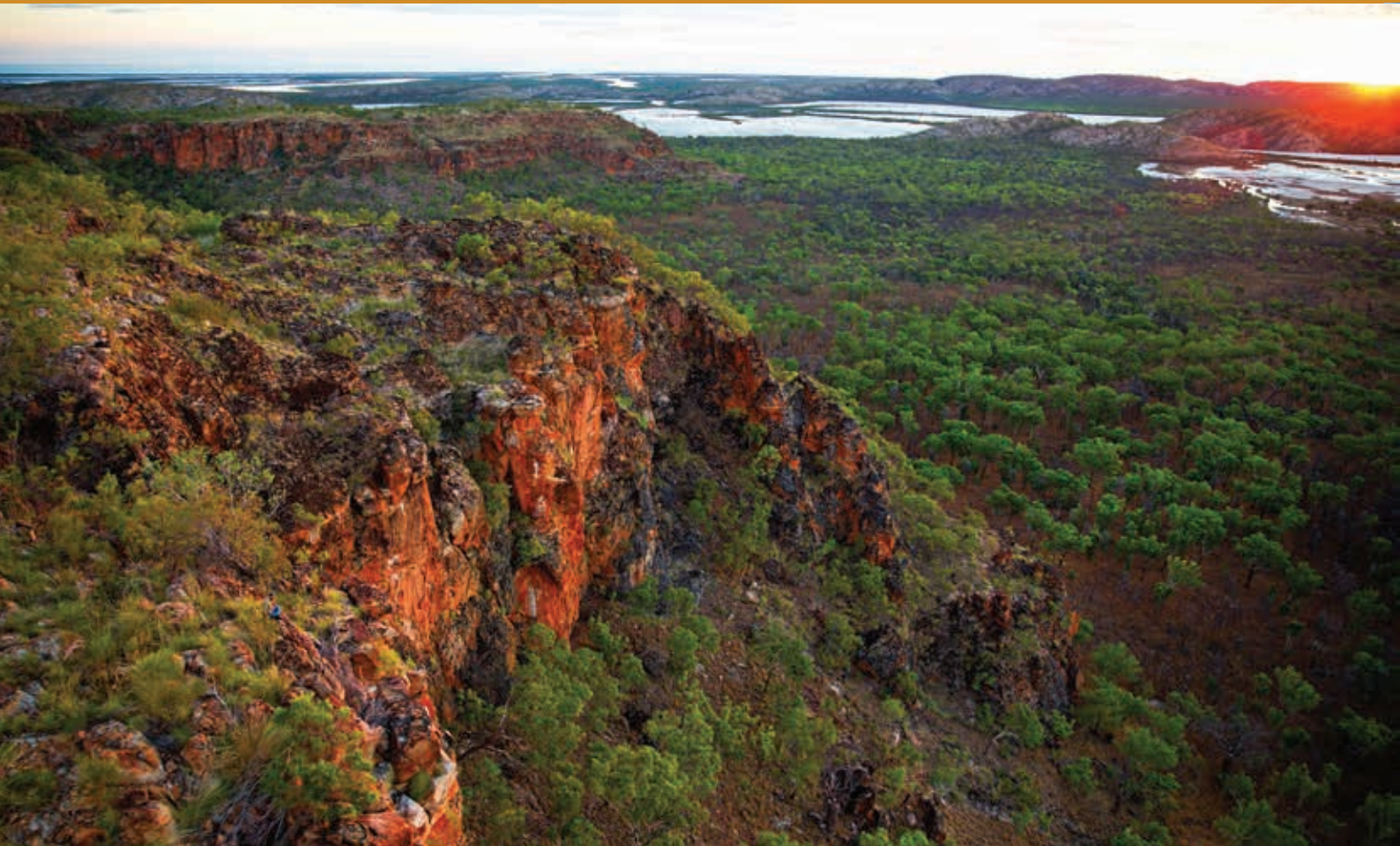
Sandstone escarpment overlooking coastal plains on Yampi