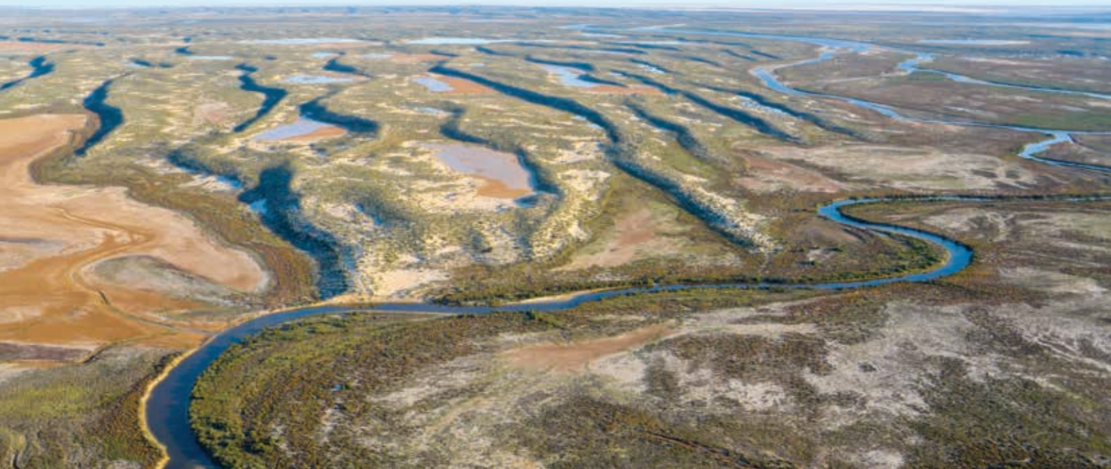
Flooded desert on Kalamurina W Lawler

Australian Wildlife Conservancy delivers the most extensive program of field science across the nation. At the heart of our science program are annual biological surveys – audits of ecological health – at each sanctuary. Here is a brief snapshot of the action from some recent surveys.