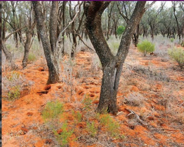
Bilby diggings (Scotia) illustrate their role as ecosystem engineers.

There are large gaps in our knowledge of the ecology of many of Australia's endangered mammal species. AWC ecologists are generating important new information about several species, undertaking intensive research in relation to population dynamics, movement and habitat preferences for reintroduced mammals.