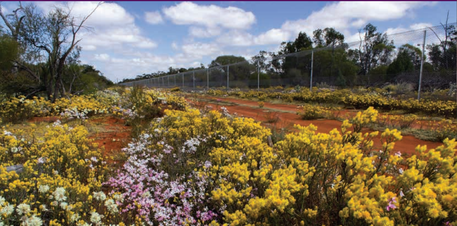
Feral-predator proof fence at Mt Gibson

AWC is leading the way in establishing a national network of feral predator-free areas ranging from south-west Australia (Karakamia, Mt Gibson) through central Australia (Newhaven), South Australia (Yookamurra) and into NSW (the Pilliga, Mallee Cliffs and Scotia).