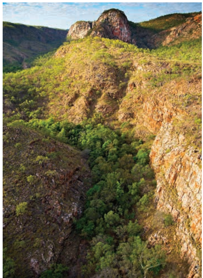
Rugged topography protects pockets of rainforest

Yampi contains an exceptional diversity of ecosystems – several types of rainforest and vine thickets, a large variety of woodlands, pindan scrub, mangrove forests, marine swamps, freshwater wetlands and riparian communities, fire protected sandstone communities and blacksoil plains.