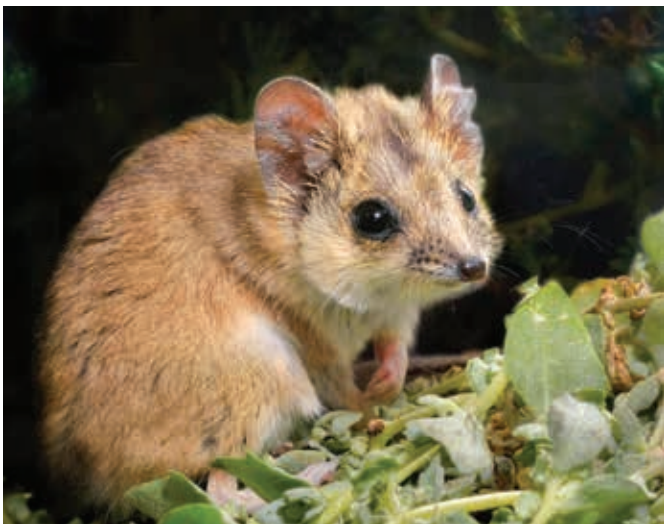
Stripe-faced Dunnart caught during survey at Kalamurina

Kalamurina: Located adjacent to Kati Thanda-Lake Eyre in one of the world's driest regions, Kalamurina has this year enjoyed exceptional rainfall. Around 400 mm (more than twice the average annual rainfall) has fallen on the property, flooding the Simpson and Tirari Deserts and causing the Warburton Creek to flow almost all year. Taking advantage of these exceptional conditions, our team of arid zone specialists were dropped by helicopter into unexplored country north of Lake Eyre to sample habitats that have previously never been surveyed. The results confirmed a boom in small mammals following the good conditions, with high capture rates of Desert Mice (a species which has only been caught once before on Kalamurina) and the property's first ever record of a Giles Planigale.