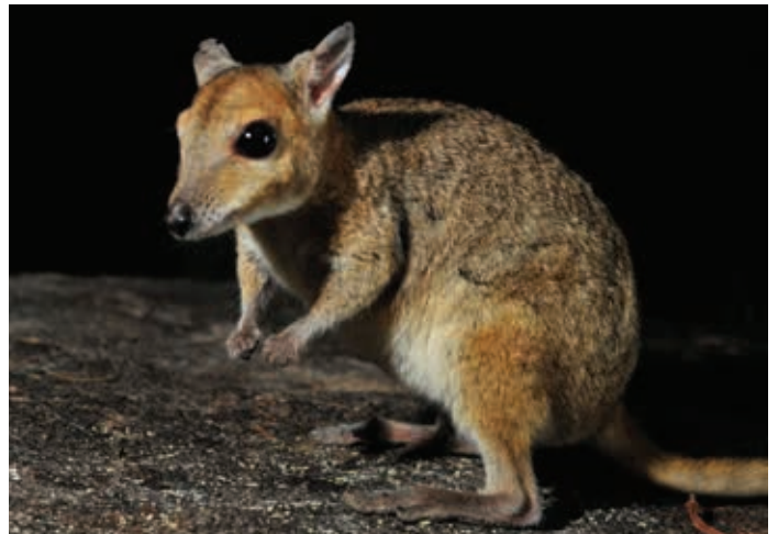
Yampi is home to the world's smallest rock-wallaby, the Monjon

Central to the success of the partnership will be the involvement of Yampi's traditional owners – the Dambimangari people. The initiative will deliver a significant increase in Dambimangari involvement at Yampi through employment as part of the AWC on-ground team, training and ongoing engagement in the design and delivery of fire management and other land management strategies.