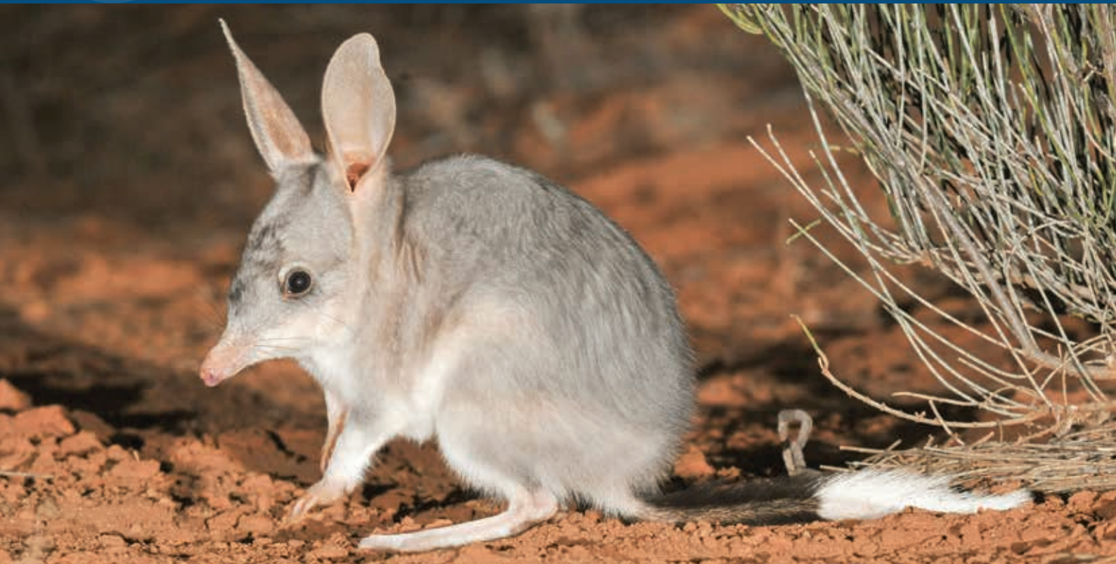
Greater Bilby at Scotia Wildlife Sanctuary W Lawler