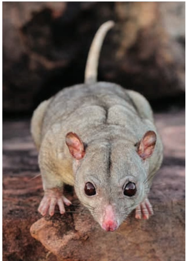
The Wyulda, or Scaly-tailed Possum, is found only in the Kimberley

Yampi and surrounds (including the Artesian Range) are also a last refuge for several rare and declining species, which are found nowhere else in Australia, including the Kimberley Rock-rat, Monjon, Rough-scaled Python and several other reptile species.