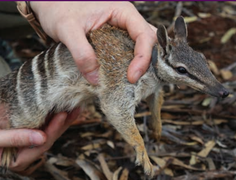
Numbat release at Mt Gibson Wildlife Sanctuary