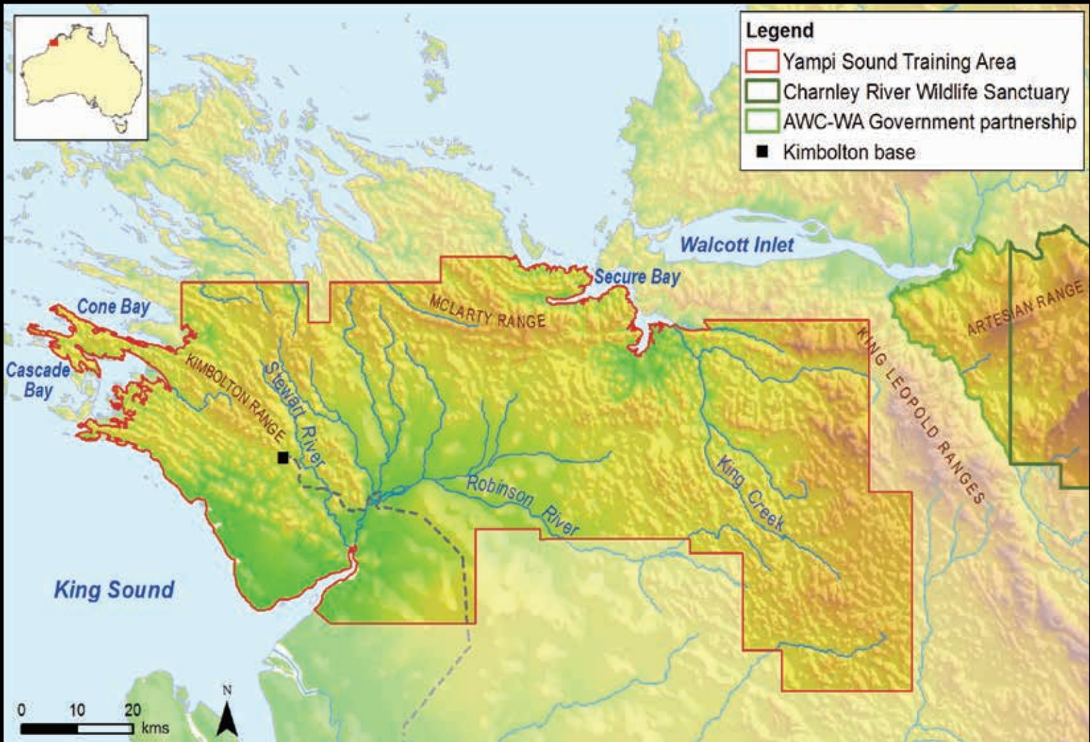
Yampi Sound Training Area and adjacent AWC-managed land.